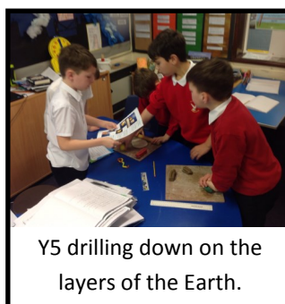
Y5 drilling down on the layers of the Earth.

We are looking forward to seeing you in school next week at our Parent Teacher Progress Meetings.