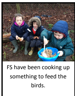
FS have been cooking up something to feed the birds.