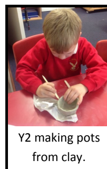
Y2 making pots from clay.