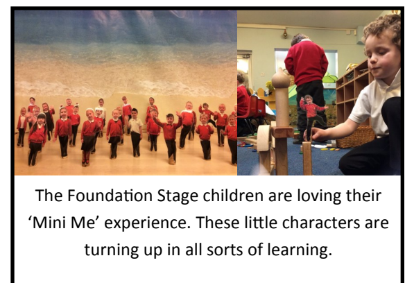
The Foundation Stage children are loving their 'Mini Me' experience. These little characters are turning up in all sorts of learning.